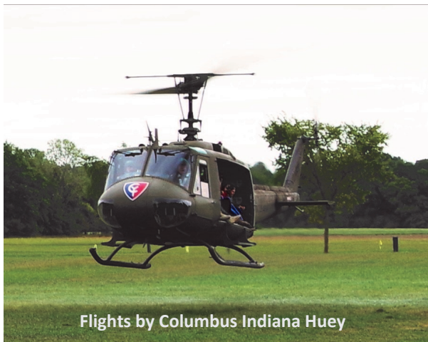
Flights by Columbus Indiana Huey

MILITARY VEHICLE SHOW & SWAP MEET Fri. 9AM-4PM & Sat. 9AM-3PM, September 19-20, 2025